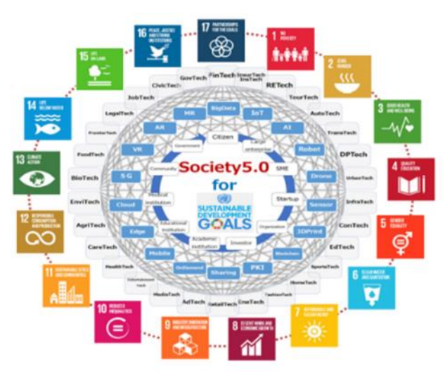
Figure 1: Society 5.0

Although Society 5.0 is the development program of Japan, it is not limited to Japan because its goals are proportionate to those of the Sustainable Development Goals (SDGs) of the UNDP (United Nations Development Programme). SDGs are usually targets for change, regardless of how the course of action varies depending on the country or region's money-related condition or social system. Society 5.0 is, in a way, Japan's approach to managing the perception of some of the goals identified by the SDG. Meanwhile, the cultural disruptions faced by Japan, for example, by growing masses, declining birth rates, declining populations, and evolving state, are problems that different countries will also eventually look at. Beginning from this point of view, Japan is one of the most important nations to solve these problems. By Society 5.0's early goals of these problems, and by providing such solutions to the world, Japan will contribute to resolving relative difficulties worldwide and achieving SDGs.